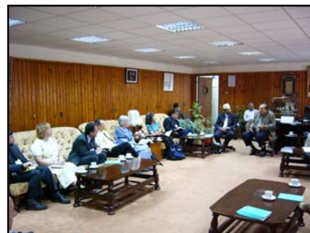
Administration of Al Azhar University