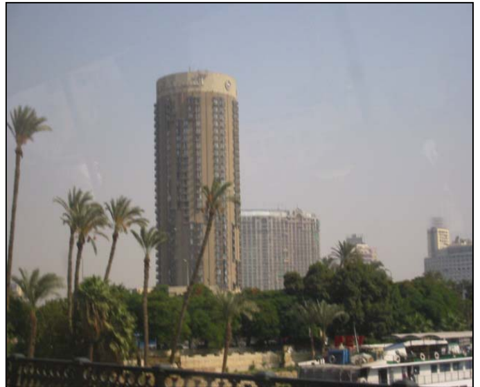
Al Gezira Sheraton Hotel - Cairo