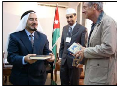
Minister of Al Awqaf