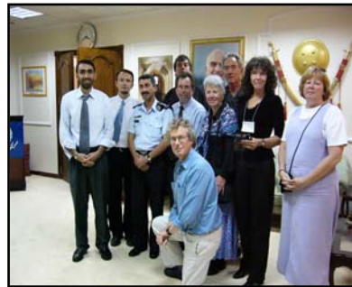
Reception at Jordanian Border