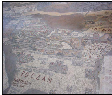
Mosaic Map of the Holy Land