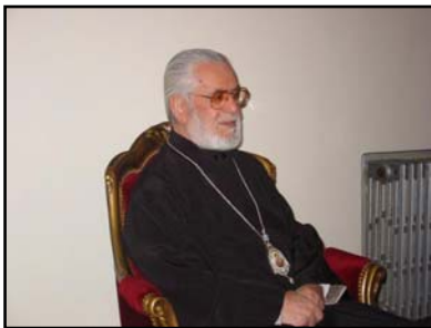
Patriarch Ignatius Hazeem the 4 th Patriarch of Antioch for the Greek Orthodox Community