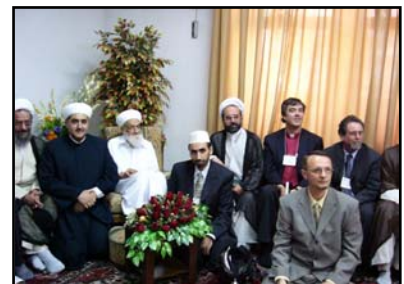
Grand Mufti of Syria