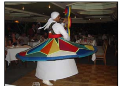
Cruise on the Nile