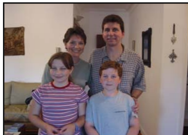
Christian Minister w/his family