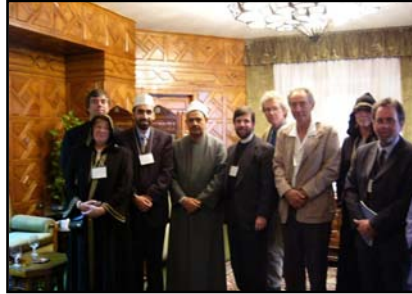
Grand Mufti of Egypt