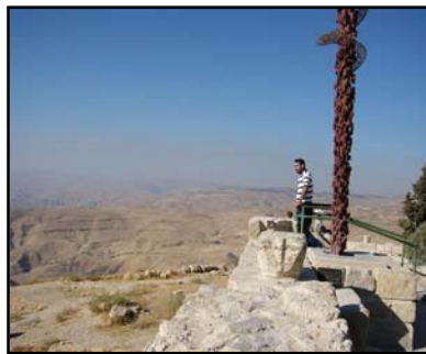
Facing the Holy Land