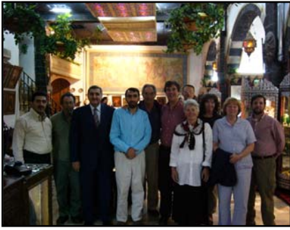
Dinner - 1200 years old house