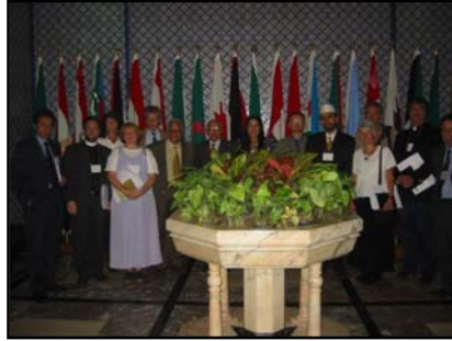
League of Arab States