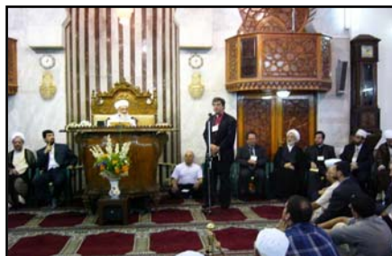
Sheikh Ahmad Kuftaro