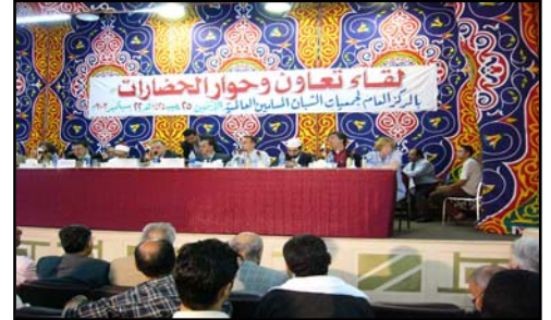
Muslim Youth Association & YMCA