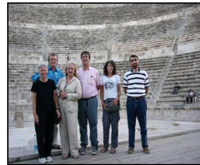
Amman Roman Amphitheatre