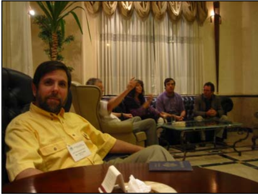
Bristol Hotel - Amman