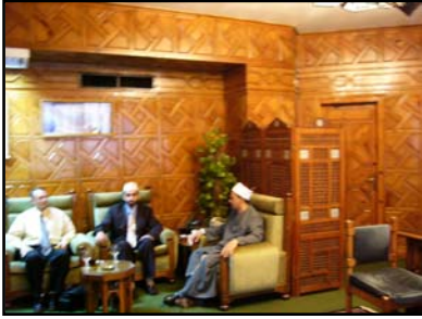
Dr. Ahmad Al Tayeb