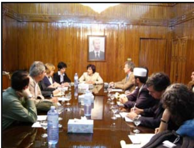
Dr. Bouthaina Sha'aban