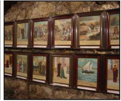
St. Paul's Conversion